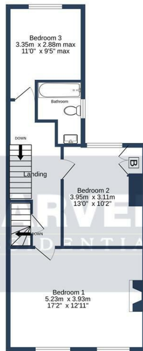
1ST FLOOR 55.4 sq.m. (596 sq.ft.) approx.