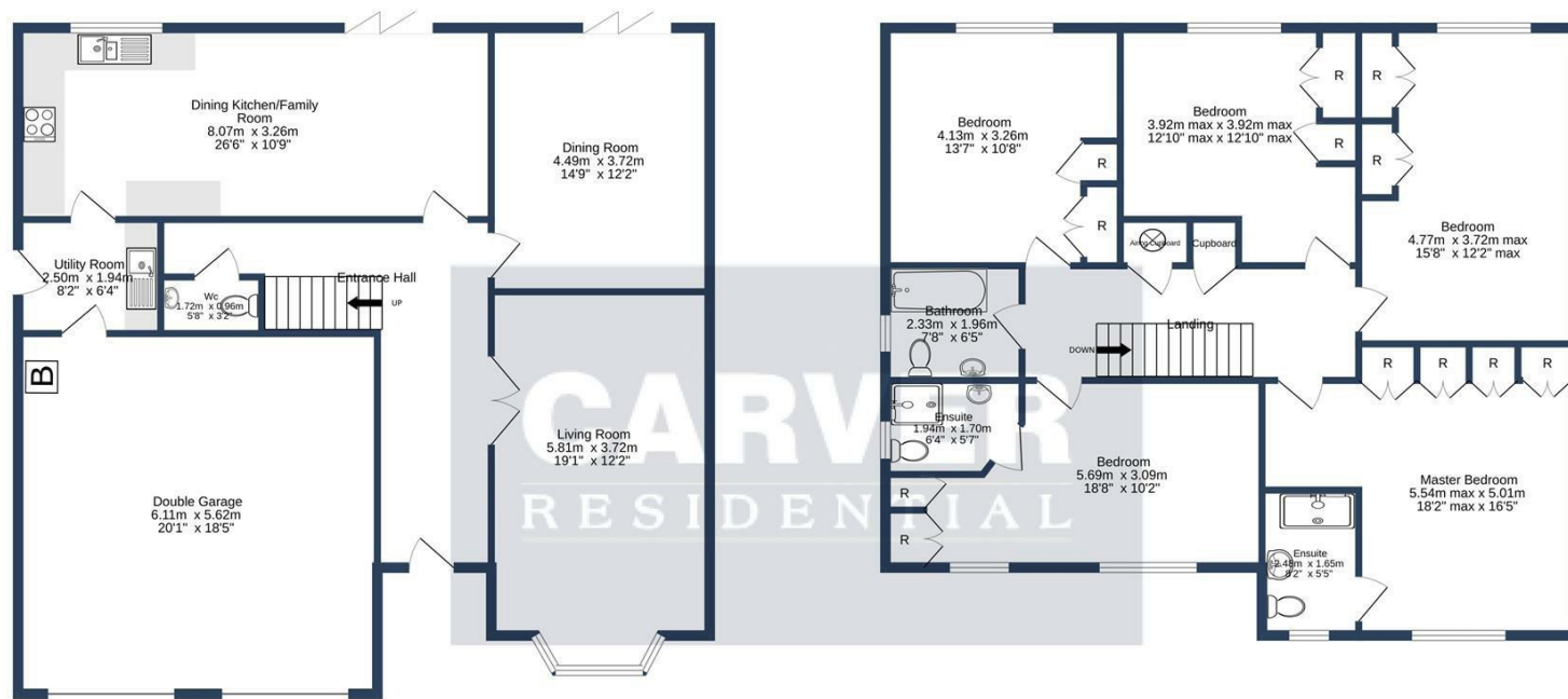
GROUND FLOOR 127.0 sq.m. (1367 sq.ft.) approx.