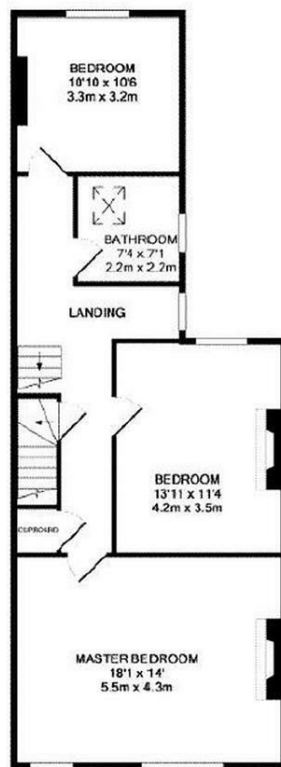
1ST FLOOR APPROX. FLOOR AREA 161 SQ.FT. (15.0 SQ.M)