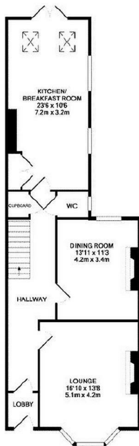
GROUND FLOOR APPROX. FLOOR AREA 131 SQ.FT. (12.2 SQ.M)