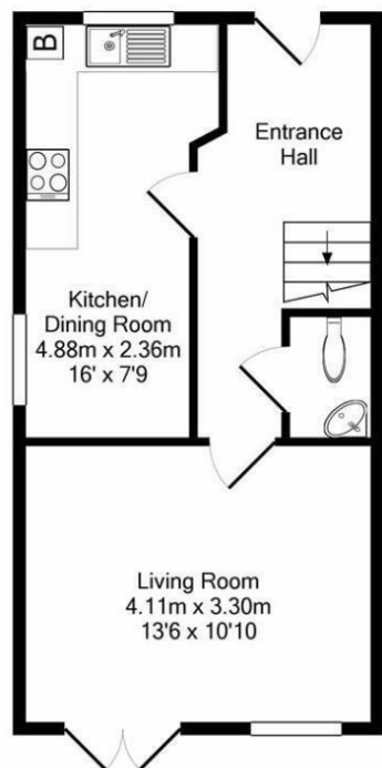
GROUND FLOOR APPROX. FLOOR AREA 33.5 SQ.M. (361 SQ.FT.)