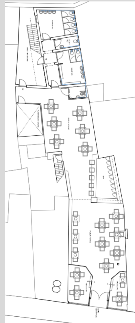
Example Space Plan (Bar)

18 St Cuthberts Way Darlington, County Durham DL1 1GB Telephone: 01325 466945